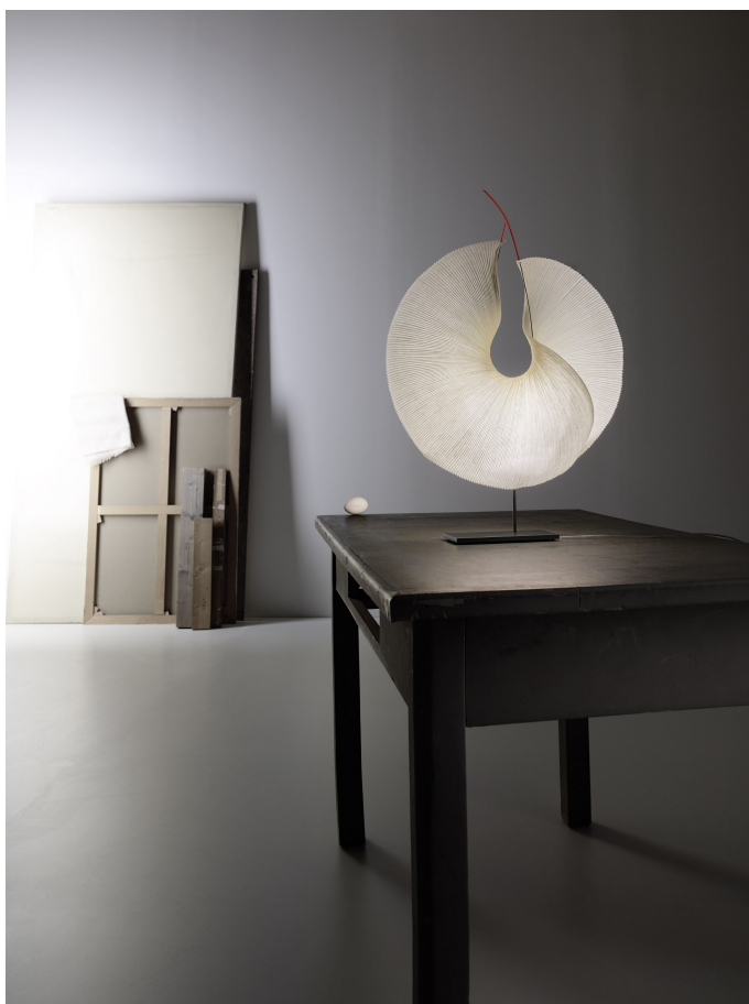
Yoruba Rose DAGMAR MOMBACH, INGO MAURER & TEAM 2017

Paper, metal, stainless steel, silicone. Yoruba Rose is a light object that enchants through perfection and grace. The sheet of paper is almost circularly stretched on light metal wires and strives upwards. The harmonious expression of the model and the extremely pleasant light make it the ideal light source in spaces where one rests. Just as in all other MaMo Nouchies, the lampshade consists of Japanese paper, which has to undergo a special manufacturing process in Dagmar Mombach's studio. The light source is an LED module, provided with a cooling element, developed by Ingo Maurer especially for the MaMa Nouchies. The light is warm and soft, and can hardly be distinguished from conventional halogen light.