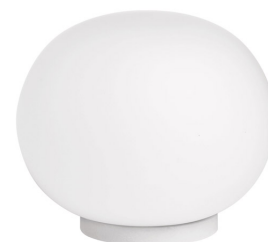
Mini Glo-Ball T designed by Jasper Morrison

Table/desk lamp providing diffused light